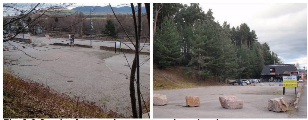
Fig. 2 & 3 – site from various perspectives showing open expanse

4. The applicant seeks permission to have this condition altered to allow the commencement of development to be delayed for a further period of 3 years. This would allow for an opportunity to allow market conditions to improve and provide for better probability of a commercially successful development. A supporting letter is attached at the back of the report.